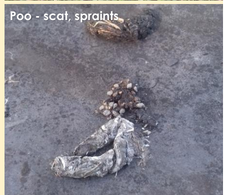
Poo - scat, spraints