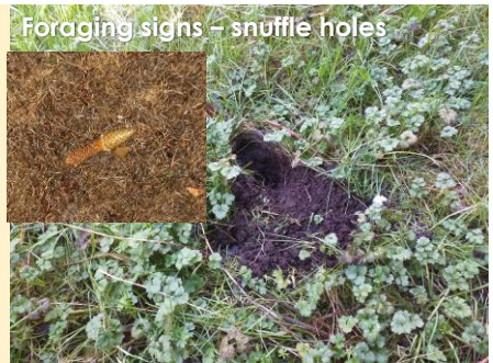
Foraging signs – snuffle holes