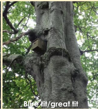
Blue tit/great tit